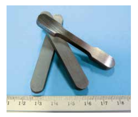
These metallic bar and dog-bone sample specimens are used to characterize behavior through tensile testing.