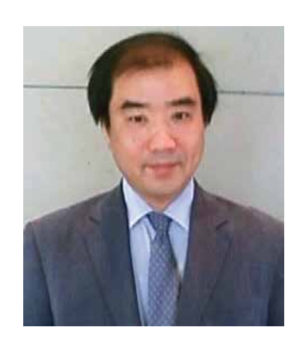
"MTS mHIL technology allows us to uncover and resolve unknown items of quality function development (QFD) during the preparation stage, reducing our vehicle testing time by at least one month."

MTS mHIL technology extends the broadly used Hardware-in-the-Loop (HIL) technology used for validating electronic controller units (ECUs), by placing