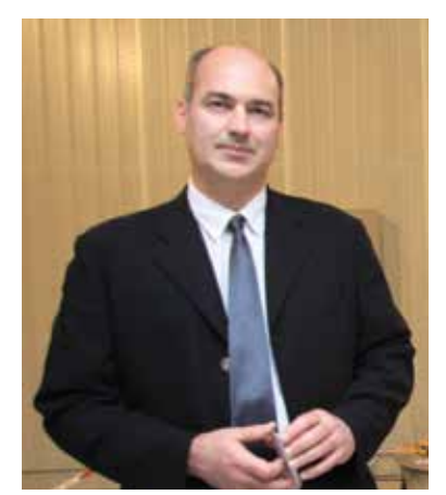
"Tier 1 and Tier 2 automotive manufacturers in France know MTS test equipment. They are familiar with the MTS reputation for test systems that deliver high performance, reliability and flexibility."

CED's two MTS MAST systems employ a hexapod design, which delivers tightly controlled excitation at very high frequencies through the repeatable and simultaneous application of force and motion from six minimal-mass servohydraulic actuators.