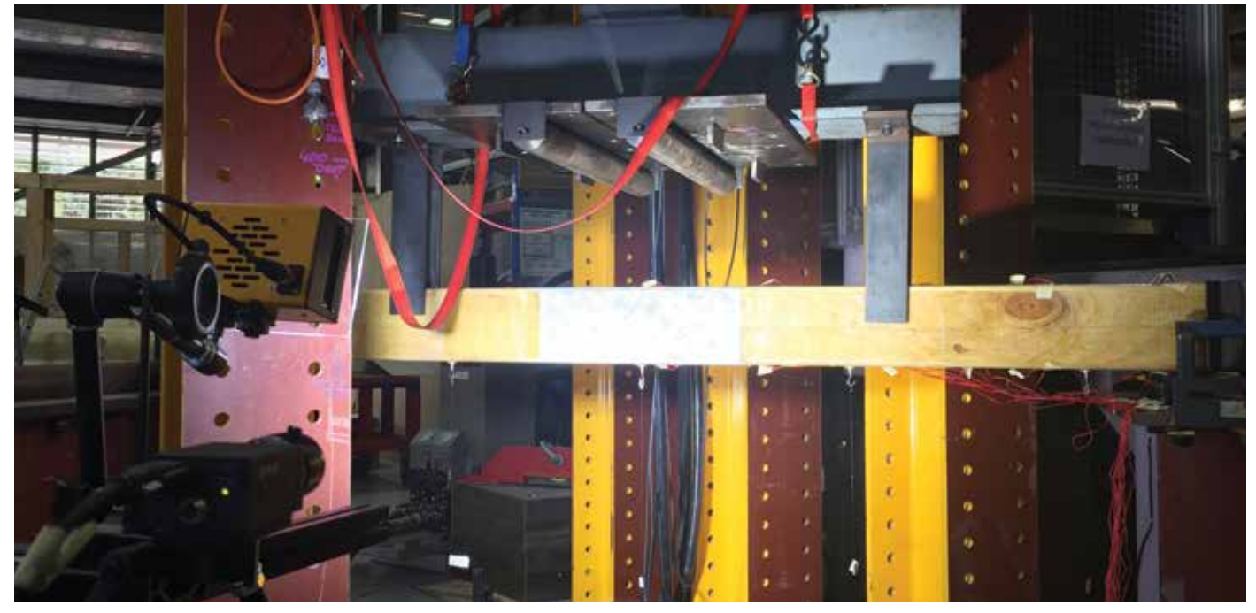
The University of Queensland Structures Lab integrates MTS Universal Test System with strain gages, linear potentiometers, and a Correlated Solutions VIC-3D DIC system.

The University's UTM was used in displacement control to induce the proper loads on the HFT beam test specimen. In order to completely and accurately gather measurements at all the beam's critical points, several devices were employed as described earlier. In the picture above, strain gauges were attached on the top and bottom flanges of the beam. Linear potentiometers were also attached to the bottom flange to capture the beam displacement in the loading direction. Finally, the 3D DIC system's stereo cameras were horizontally mounted to measure the full-field displacement and strain distribution over the front web of the beam, this test's most important area of analysis.