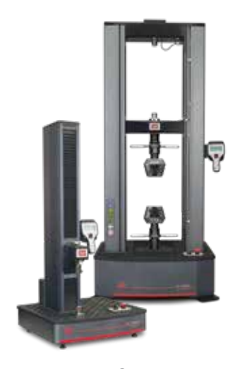
MTS Exceed® Electromechanical Universal Test Systems