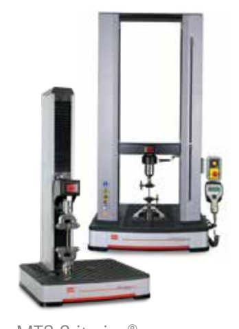
MTS Criterion® Electromechanical Universal Test Systems