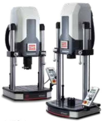
MTS Acumen® Electrodynamic Test Systems